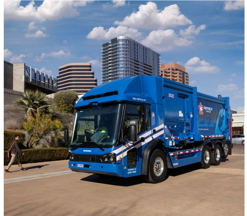
McNeilus® Volterra ZSL™

* Non-GAAP results. See appendix for reconciliation to GAAP results.