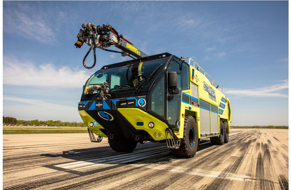
Oshkosh Striker® Volterra™ Electric ARFF