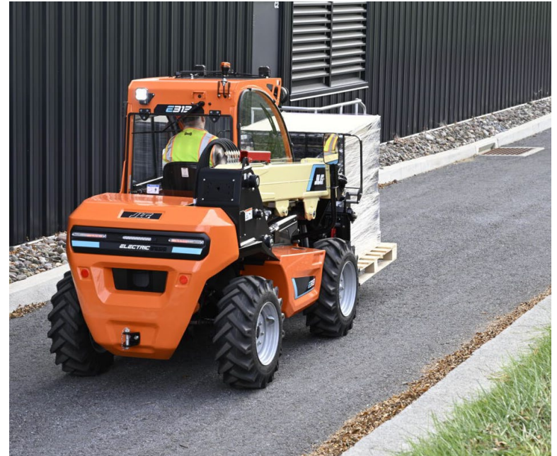
JLG® E313 Electric Telehandler

* Non-GAAP results. See appendix for reconciliation to GAAP results